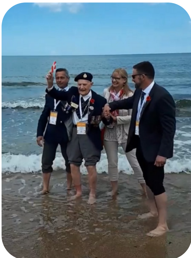
Invasion of Normandy 80th