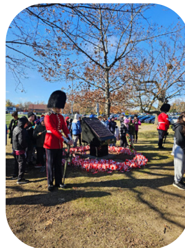
John-Abbott College Commemoration