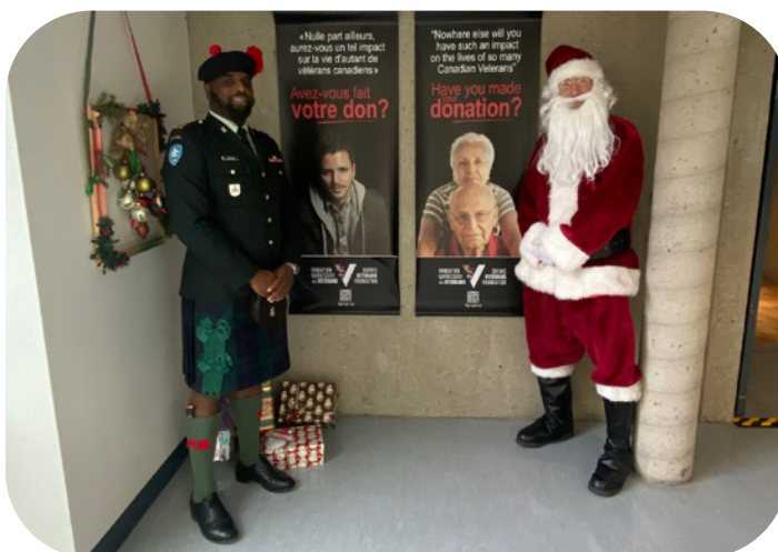
Blackwatch Christmas Visit