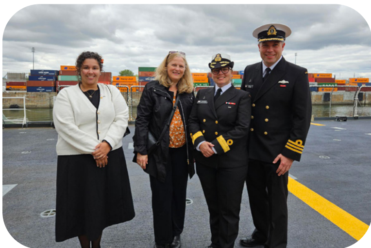
Visit to the HMCS William Hall Icebreaker