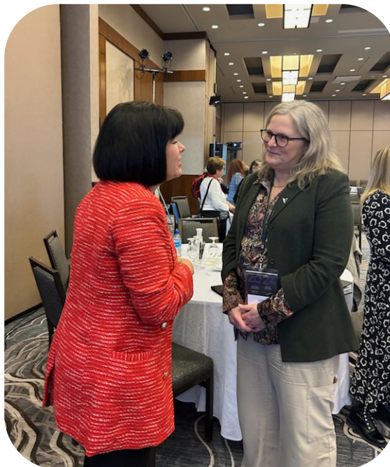
Womens Veterans' forum in Montreal with Minister Ginette Petitpas-Taylor